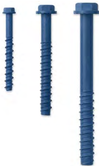
FIGURE 1—TAPCON+ SCREW ANCHOR WITH ADVANCED THREADFORM TECHNOLOGY