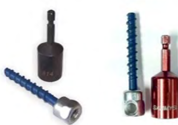
SAMMYS Vertical Threaded Rod Anchor (Model No. CCST 516) with torque-limiting nut driver (#14 Black Nut Driver)