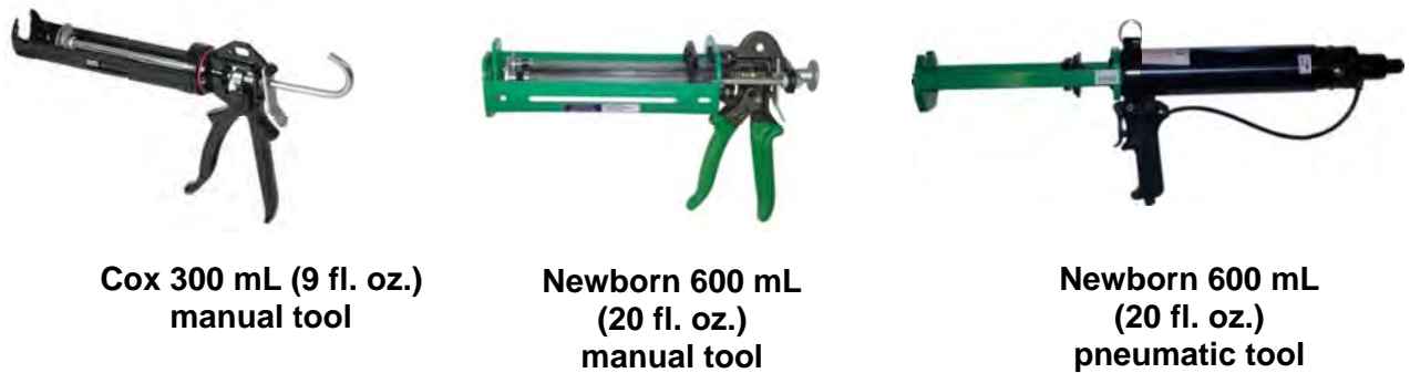
FIGURE 2—ADDITIONAL DISPENSING TOOLS FOR USE WITH RED HEAD EPCON C6+ ADHESIVE ANCHORING SYSTEM