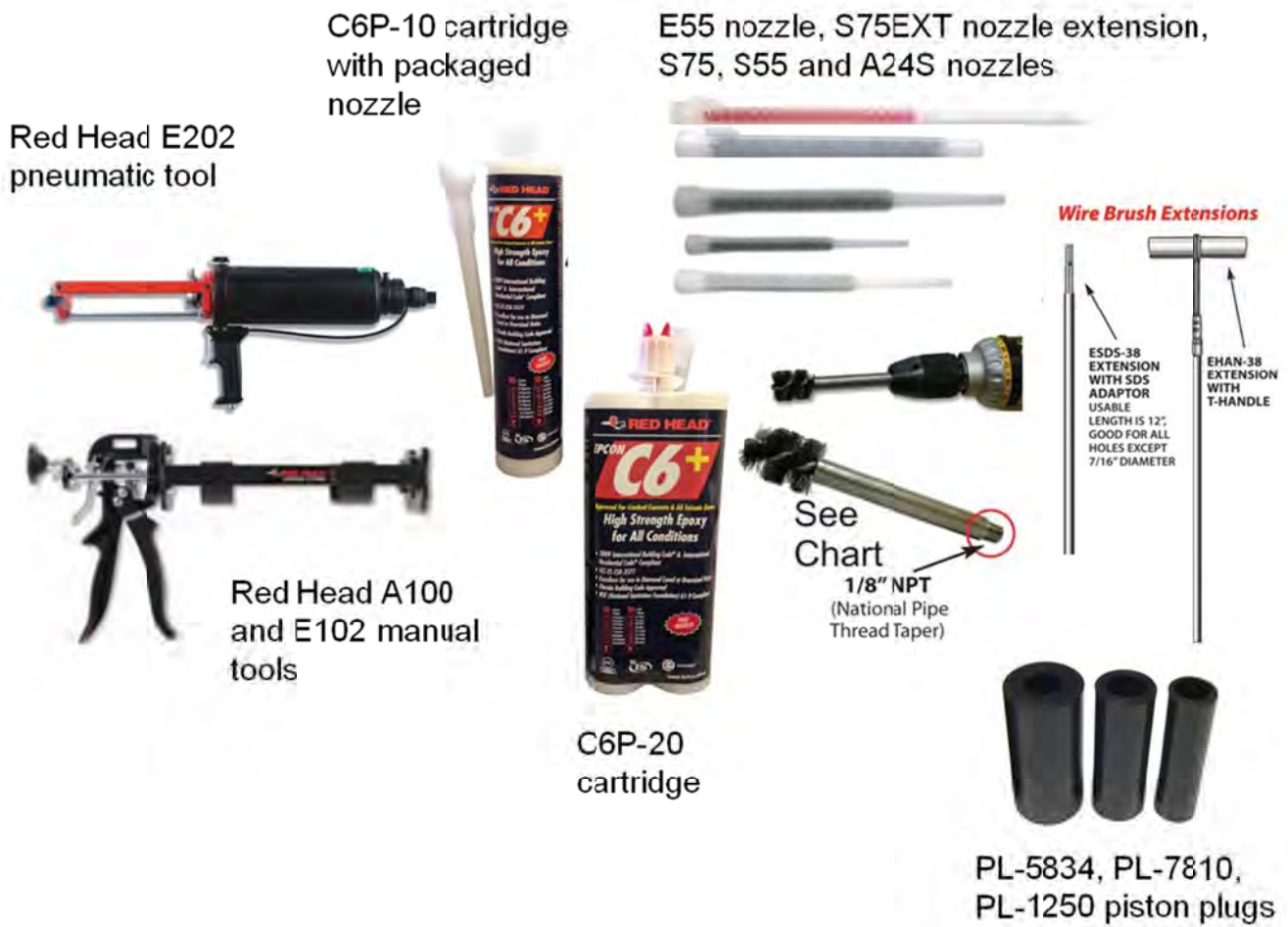
FIGURE 1—RED HEAD EPCON C6+ ADHESIVE ANCHORING SYSTEM